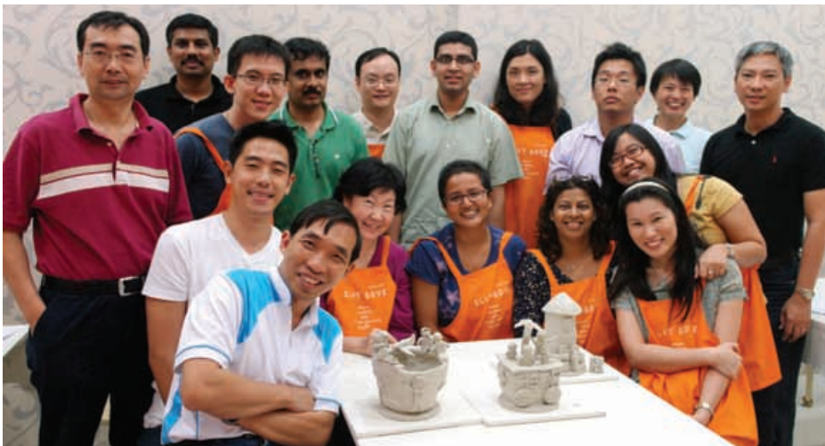
Having fun with clay at our retreat (2012)

In line with Singapore's 50th birthday, we have lined up a series of articles to bring you on a journey through research at the various NHG institutions and departments over the years. In this first instalment, we feature the Health Services & Outcomes Research (HSOR) unit of NHG who will coincidentally be celebrating their 10th Anniversary in 2015!