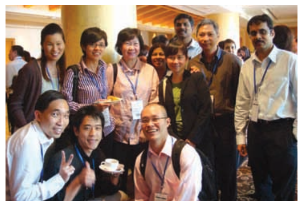
The team at the Adding Years of Healthy Life conference (2010)

As HSOR commemorates a decade's worth of experience and achievements, we are beholden to the NHG management for their invaluable confidence, our partners for their unstinting support, and our colleagues, past and present, for their knowledge and contributions to the synergy and success of the team. We look forward to continuing our journey together to adding years of healthy life to the people of Singapore through excellence in health services research!