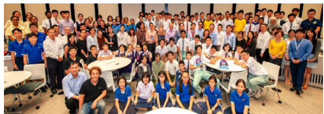
Group picture with the SGCC finalists