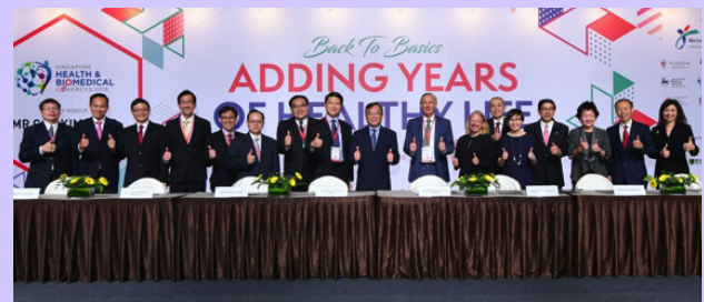
Eight-party MOA with signatories and witnesses from NHG, LKCMedicine and the Institutes of Higher Learning : Parties from left to right – TP; ITE; NYP; NHG; Minister Gan Kim Yong; LKCMedicine; NP; RP and SP

The student internship programme is a collaborative effort between gAmes for heaLth InnoVation cEntre (ALIVE – a joint centre between NHG and NTU's LKCMedicine) and the Schools of Interactive and Digital Media represented by five Polytechnics: Nanyang Polytechnic (NYP); Ngee Ann Polytechnic (NP); Republic Polytechnic (RP); Temasek Polytechnic (TP) and Singapore Polytechnic (SP), and the Institute of Technical Education (ITE). In this programme, ALIVE will provide healthcare experts to co-develop serious games prototypes with the students who have expertise in games design/storytelling; graphics design and IT infrastructure. The parties hope to use digital media technologies to co-create and translate ideas into user-friendly solutions for better health outcomes.